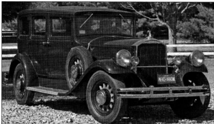
A 1931 Pierce-Arrow Eight sedan, similar to the Tesla electric test car.

Outside of town, the country roads of America were so primitive that they became the preserve of the rapid (and rapidly improving), long-range, internal combustion engine car. Thus, a sort of golden age of electric vehicles persisted in America after the rest of the world had begun to discard them. Detroit Electric, Columbia, Baker, Rauch & Lang, and Woods were the most significant among a host of manufacturers of this type of vehicle.