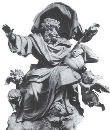
GOD SAYS THE BIBLE was just a short grocery list when it left his desk, and is now pretty much unrecognizable.

God agreed that commercial interests and multinational corporations will be joined by religious interests in swaying academic content down the road.