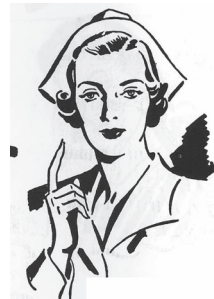
THE POOR have really bad habits, such as refusing to invest in Cargill.

The United States Department of Agriculture (USDA) presented definitive proof recently that food riots over skyrocketing food prices and worldwide shortages are only happening to people who deserve to starve anyway.