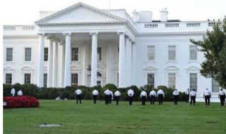
SECURITY OFFICIALS at the White House check for fence jumpers hourly since the new fence-jumping craze caught fire.

White House officials are asking the public for suggestions for stopping or even just distracting the jumpers long enough to get them to sign video releases.