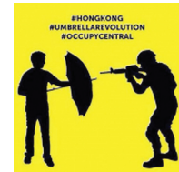
AVOID GIVING umbrellas to people this holiday season, as they are considered dangerous weapons and might get them killed.