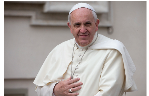
NOBODY CAN TELL if Pope Francis is seriously embracing evolution or if he just loves to scare the crap out of his cardinals.