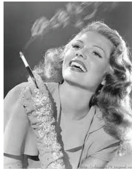
Reynolds American finally conceded that tobacco-soaked carpets outgassing carcinogens are not all that glamorous.

Smokefree advocates did not get back to the Pepper Spray Times for com-