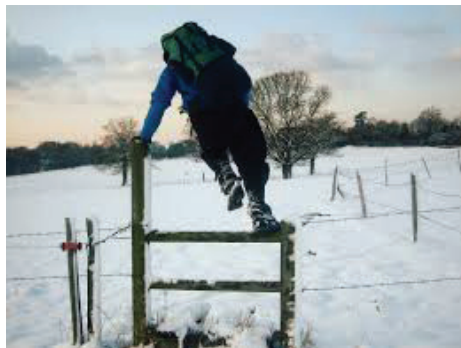
THE BEST WHITE HOUSE FENCE jumpers train in cold climates at high altitudes wearing heavy packs on their backs.

"...thrill-seekers jumping over the White House fence and running around the portico have ... made a mockery of the second fence, too...."